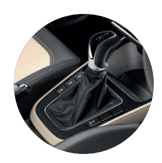
Automatic Transmission The Car is offered 6-Speed Automatic Transmission.