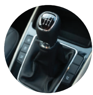
Manual Transmission The Car is offered 6-Speed Manual Transmission.