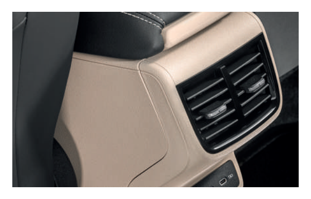
Adjustable Rear A/C Vents The adjustable rear A/C vents ensure comfort for the rear passengers in the car.