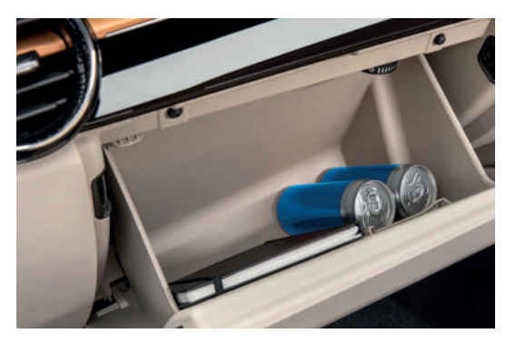
Cooled Glovebox Enjoy hassle-free storage space for perishables in the dashboard.