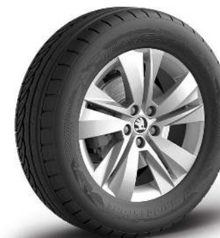
AMBITION ALLOY WHEELS R(16), GRUS BLACK FABRIC SEATS WITH DUAL COLOUR SPORTY CENTRE STRIPES