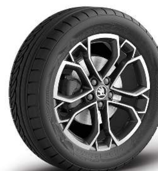
STYLE ALLOY WHEELS R(17), ATLAS BLACK FRONT LEATHER/REAR LEATHERETTE SEATS WITH PERFORATED GREY DESIGNS