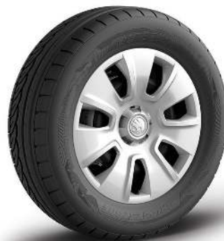
ACTIVE STEEL WHEELS R(16), LHOTSE BLACK FABRIC WOVEN SEATS